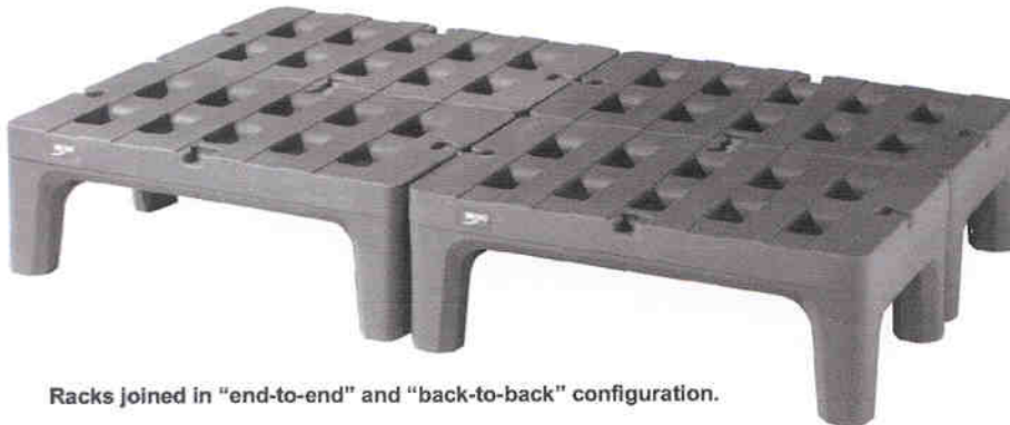
Racks joined in "end-to-end" and "back-to-back" configuration.